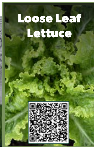
Loose Leaf Lettuce