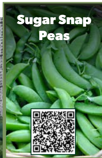
Sugar Snap Peas